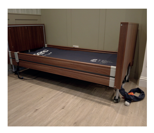
2 Place the Autoturn system on the bed base, the hose connection should be at the foot end of the bed