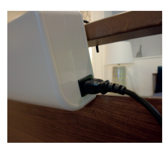
6 Insert the hose connection to the pump and connect the power cord