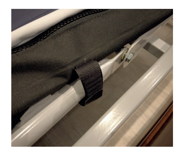
3 Attach the system to the bed using the straps on the cover