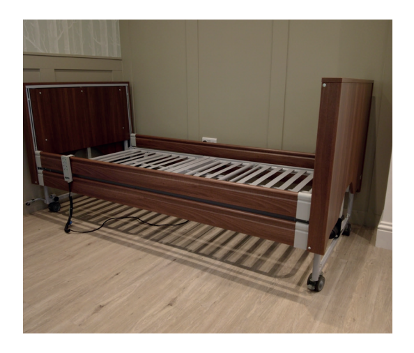
1 Remove the mattress from the bed