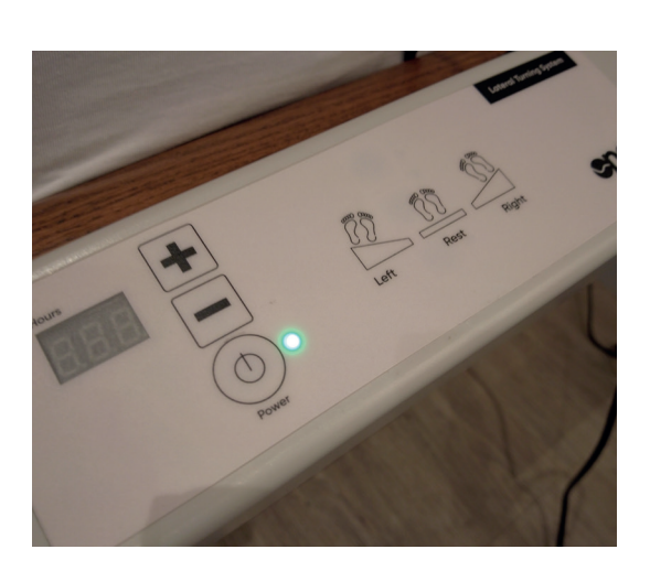
7 Power on the pump