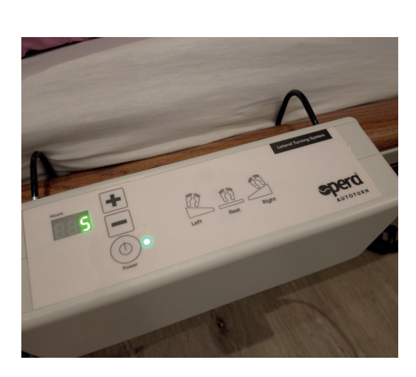
8 Set the timer using the + and - buttons (The number in the timer indicates how many hours the system should run automatically.)

10 | AutoTurn Lateral Turning System operabeds.com | 11