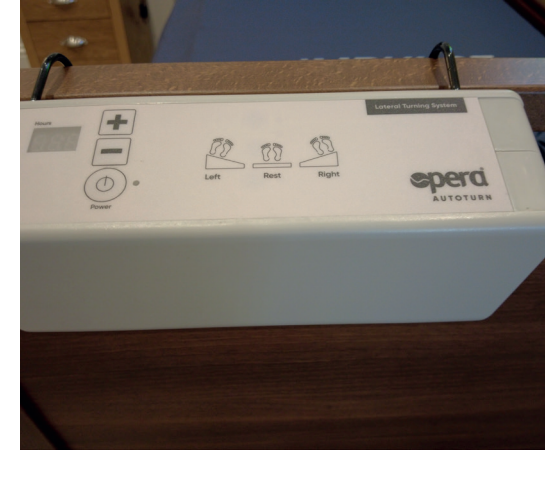
5 Place the Autoturn pump on the end of the bed using the two braces located on the back of the pump