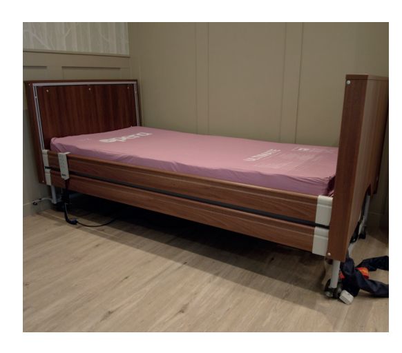
4 Place the mattress back onto the bed, on top of the Autoturn system